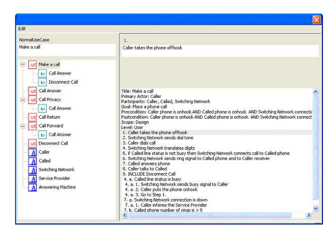
Figure 2: Extract of the Use Case Edition interface.

Use Cases are captured in restricted form of natural language through a specific interface of UCEd. Figure 2 shows a use case being edited with UCEd. The grammar used for our restricted form of natu-