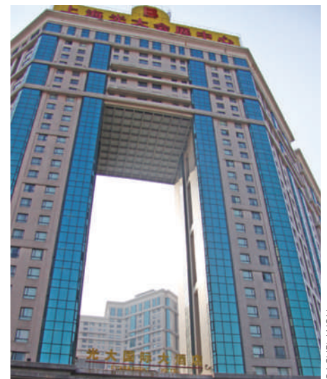
Shanghai Everbright Convention and Exhibition Center in China housed 800 attendees from all over the world.

Carriers were forced to move to 40G ports on their core routers when the size of the Internet Protocol data flows did not allow them to utilize their 10G ports efficiently. 100G ports will undoubtedly handle these large flows more efficiently.