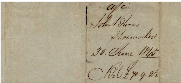
(b) Figure 5: (a) Extract of the recto side of a document with significant bleed-through. (b) Corrected version.