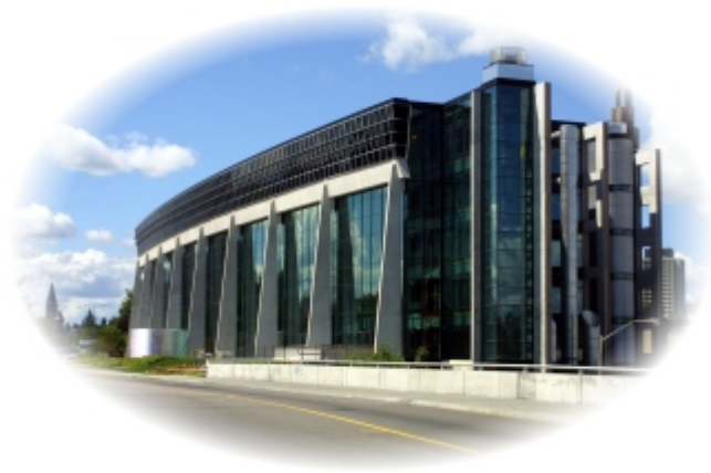
SITE Building, University of Ottawa 800 King Edward St., Ottawa

The University of Ottawa is a major research center in Canada, with a history of over 150 years and over 30,000 students. Both Ottawa and this university are bilingual (English-French).