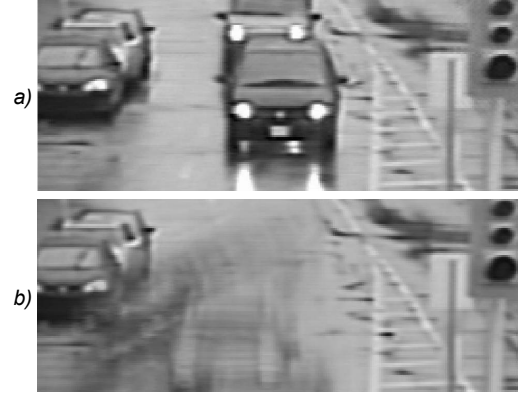
Fig. 2. Evolution of adaptive background image: a) initial background, b) updated background image after 6s.

where \alpha allows to control the background transition rate and is proportional to the ratio of the peak distance from the origin of the histogram of D(x, y, t) and the maximum difference value computed between the current frame and the previous background image, without exceeding 0.5. In practice, this means that when illumination changes are important, the background transition rate is increased as it must map faster variations in the content of the scene. Figure 2 shows an example of a background image updated with the proposed approach.