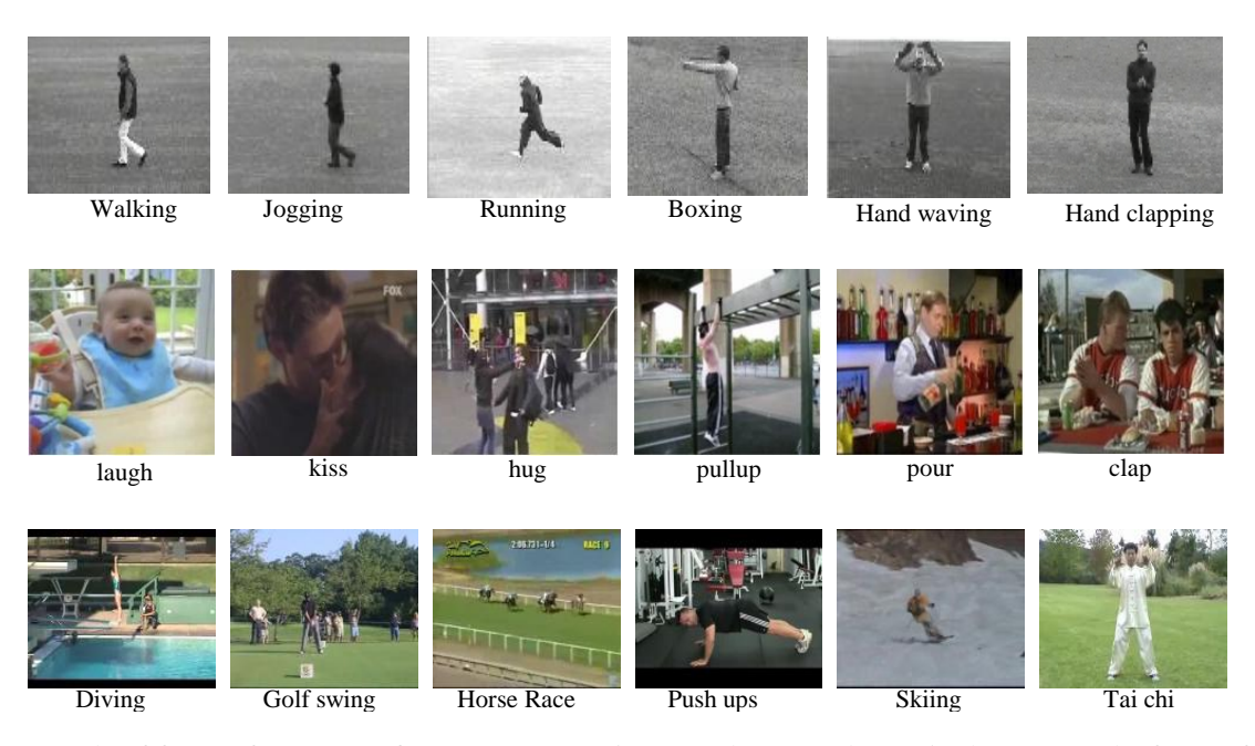
Figure 2: Sample of frames from KTH (first row), HMDB51 (second rom) and UCF50 (last row). The frames from KTH share same background for all categories. The cluttered background are shown on both HMDB51 and UCF50 datasets.

Local part model. The root filter of local part model is sampled from the dense sampling grid of the processed video at half the resolution. For each root patch, we sampled 8 (2 by 2 by 2) overlapping part filters from the full resolution video. Both root and part patches are represented with a descriptor. The histograms of 1 root patch and 8 part patches are concatenated as one local ST feature. Therefore, each feature is 9 times the dimension of a single descriptor.